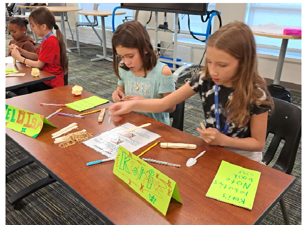
Participants from 4-H Exploration Days work on “Junk Drawer Robotics.”