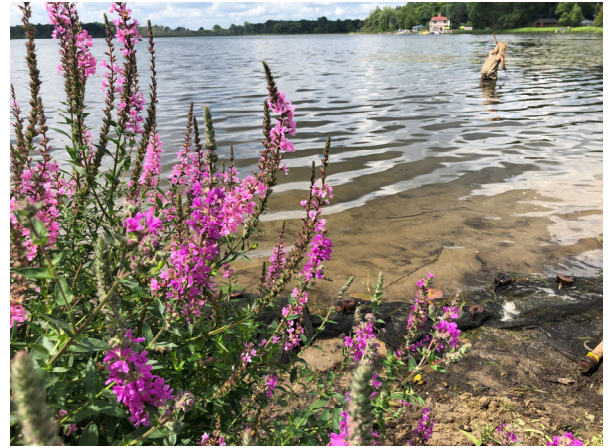
Michigan is home to more than 11,000 inland lakes and 36,000 miles of rivers and streams.

MSU Extension works with community leaders, landowners, and industry to reduce risks of water pollution, and state agencies to develop water quality information systems. The goal is to create water-protection strategies, Extension offers programs like “Introduction to Inland Lakes,” the “Conservation Stewards Program,” and “Clean Boats Clean Waters,” just to name a few. Our educators help educate the public on lakeside plants and invasive species. Visit https://www.canr.msu.edu/water_quality/ to learn more about the many water quality programs offered by MSU Extension. Gratiot County is home to many lakes, rivers, and streams, as well as thousands of acres of farm land. Water run off from storms and irrigation is also a concern for our educators. Educators attempt to bring research-based, unbiased information to apply knowledge to these critical issues.