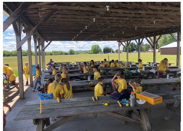
4-H Clover buds spend the day at the fairgrounds working on projects and preparing to be the next generation of Gratiot County 4-H youth.

4-H participants learn by doing. There are many programs and learning opportunities throughout the year where 4-H youth can follow their interests or attend special events. In 2022 Gratiot County youth participated programs like Interviewing for success; Goal setting; career exploration; entrepreneurship; cooking; Money Smarts, Make Your Money Grow, Communication in the workplace, 4-H Swine Workshops, and many more. Gratiot County residents participated in more than 51 different Children and Youth development programs in 2022. Some in 4-H like to say that 4-H isn't just about sows and plows. It certainly does have a strong agricultural and animal husbandry foundation, but it also allows youth to develop many skills that are transferrable to many different areas of study and careers.