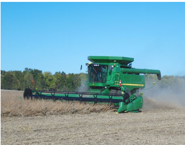
Michigan Soybean On-farm Research program is a partnership between MSU Extension and the Michigan Soybean Committee.