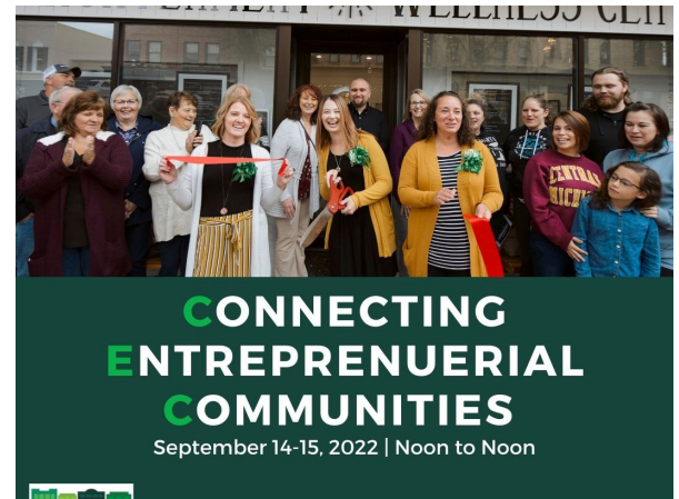
The MSU Extension 2022 Connecting Entrepreneurial Communities was a great success in downtown Alma.

Connecting Entrepreneurial Communities is a unique MSU Extension program that partners with local businesses to provide entrepreneurial education to the attendees. The program brings in business experts and local community entrepreneurs to deliver education in a variety of settings throughout the local business community. The classrooms are within and scattered throughout local businesses. This program is only conducted once a year and the local business chosen must put together a committee and bid for the opportunity to put on the conference. The 2022 program was held in Alma, Michigan. Alma has a vibrant and growing local business community and the event was considered a success by attendees, speakers, and the local community.