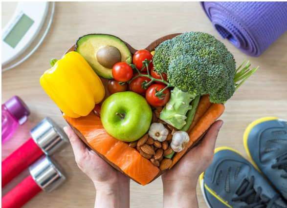
Eat Healthy, Be Active is one of the many programs that our community nutrition instructors use to help participants make better food choices and increase physical activity.

The adults in one of the Eat Healthy, Be Active programs arrived on the first day of class with sodas and energy drinks in hand. Ironically, one of the activities for the day was using real sugar and a measuring spoon as a visual of how many teaspoons of sugar can be found in all kinds of drinks, including soda and energy drinks. Each participant took turns counting out teaspoons of sugar and dumping it on a plate to guess how much there was in the drinks. When they saw the final results for soda and energy drinks, they were shocked. There were reminded that if they drank multiple sugary beverages in a day they would need to multiply the amount of sugar by the total number of drinks. This class chose to cut back on sugary beverages.