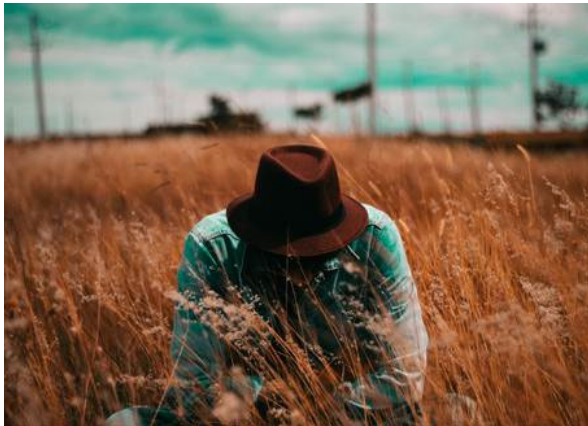
MSU Extension recognizes that with farming comes emotional stress. www.canr.msu.edu/managing_farm_stress/

Farm family stress continues to be significant. Farm family members that do not know or understand their business financial indicators causes stress. In some cases, some of the most profitable farms can have the most stress. Our farm stress educators discuss the farm's situation. Relationships can be very challenged on the family farm. Enter the critical life-changing decisions that can face a farm and the need for outside professional evaluation and assistance is imperative. In 2022, MSU Extension delivered 39 presentations and educational programs to over 1,200 participants; hosted agribusiness and farm financial decision-making sessions with 36 farmers; received more than 25,000 individual visits to the Managing Farm Stress website; and trained 17 farmers in adult Mental Health First Aid.